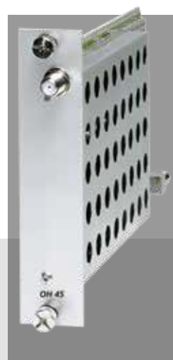
OH 45 Channel processing