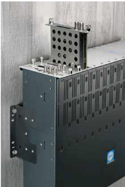
Wall mounting of WISI Compact Headend OH.

WISI Compact Headend OH operates on a high efficiency power supply, with low consumption modules in order to make a minimum ecological impact and a low operational cost. The USB connection and the RJ45 interface can be used to execute software updates for the basic unit as well as for the modules. Furthermore, all functions can be furnished from a distance per web browser.