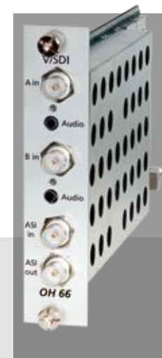
OH 66 Twin A/V encoder